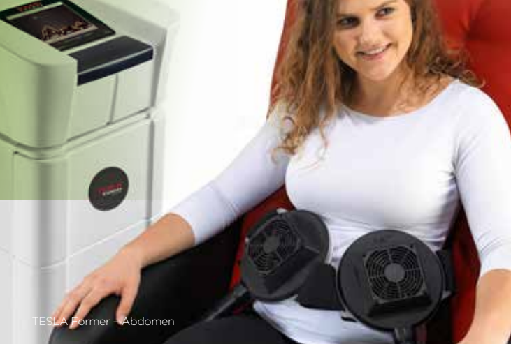
TESLA Former - Abdomen