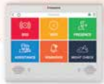
Wireless nurse call system with fall prevention and RTLS