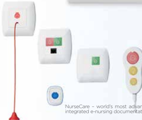
NurseCare - world's most advanced IP nurse call system with integrated e-nursing documentation