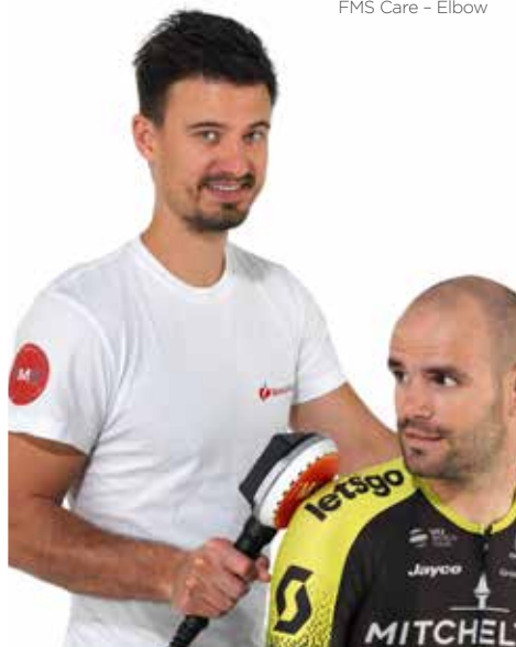
FMS Care - Elbow