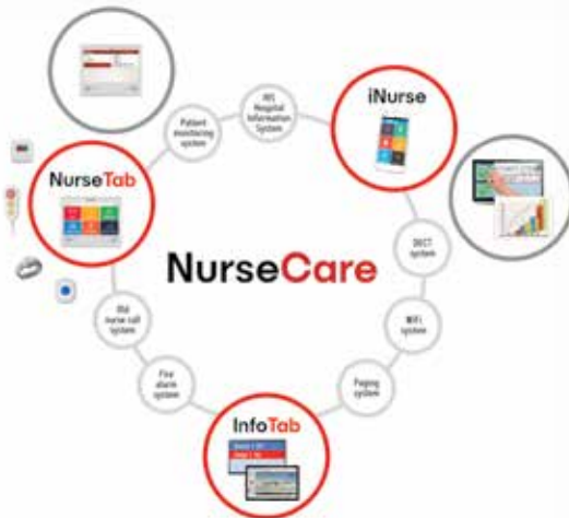
Integration of various IT systems within hospital