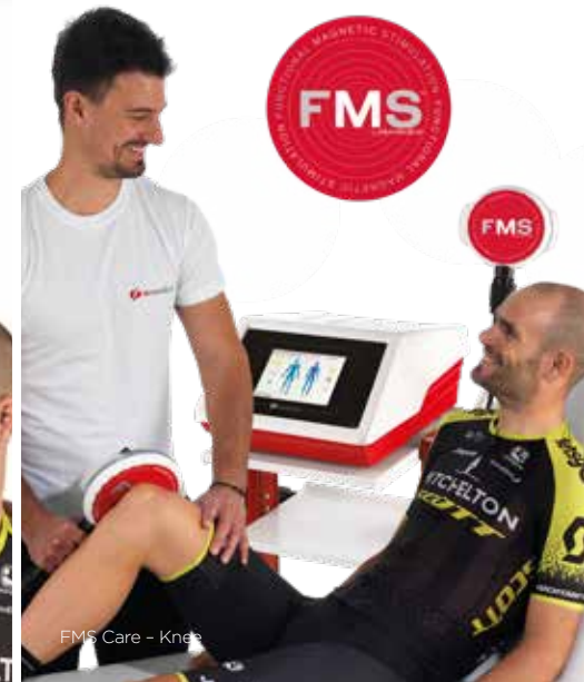
FMS Care - Knee