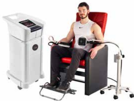
TESLA Former - Core therapy